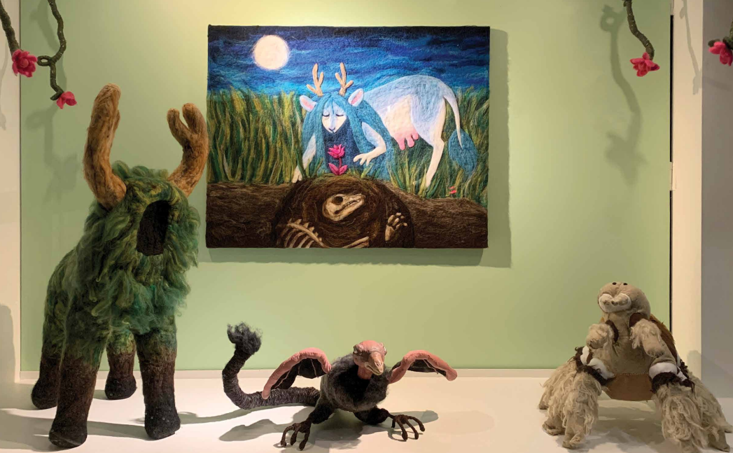
Simone King, Bloom , 2023, installation photo.