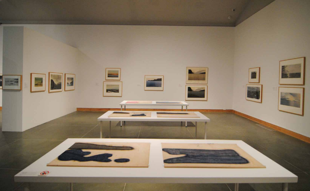
Takao Tanabe: Printmaker , at the Kelowna Art Gallery, September, 2023.