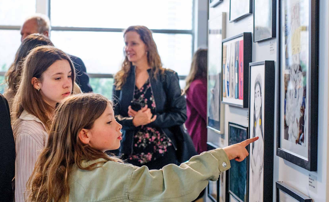
Guests at the opening reception for Art in Action: (Re)Connect , 2023.