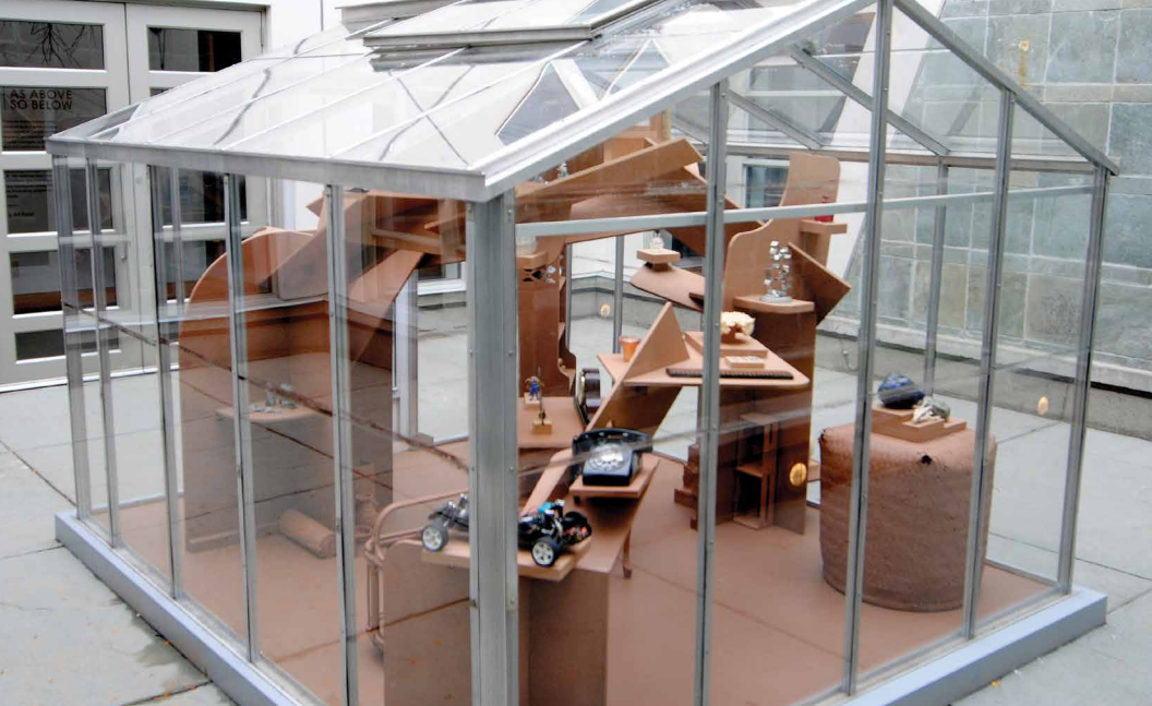
Adad Hannah, Display Case , 2023, installation photo.