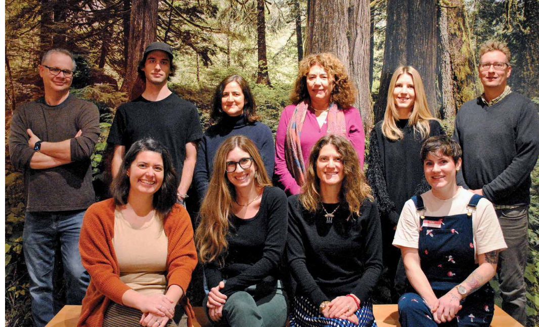
Kelowna Art Gallery Staff in the exhibition Wolves: The Art of Dempsey Bob , December 2023.

Wally Dion, Red Prairie Braids (detail), 2023. Photogravure on chine collé on paper, ed. 7/8. Collection of the Kelowna Art Gallery.