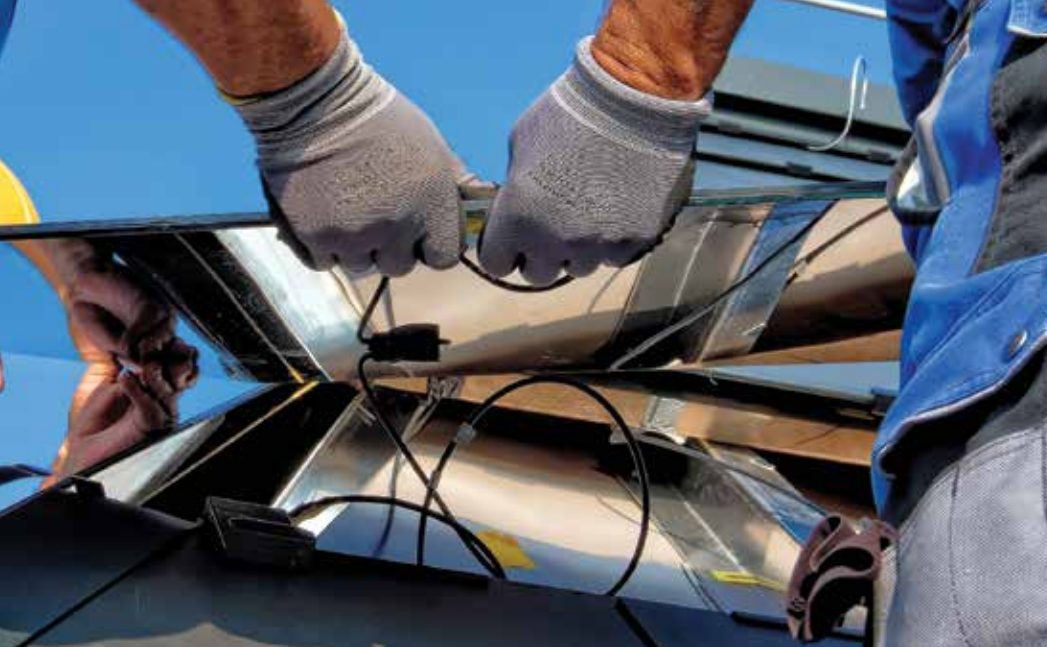
Two Men Carrying Steel Plate by Ricardo Gomez Angel, 2019, CC BY-SA.