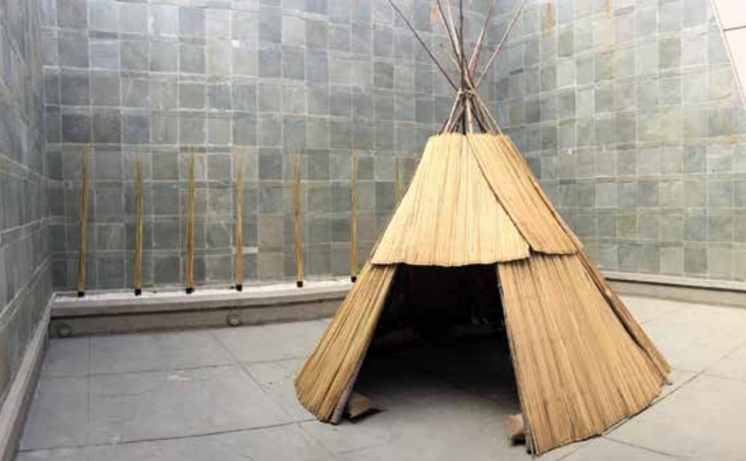
Mariel Belanger, tukwtñixw - Moon Lodge , 2019, tule reeds, hemp rope, saplings, cedar poles.