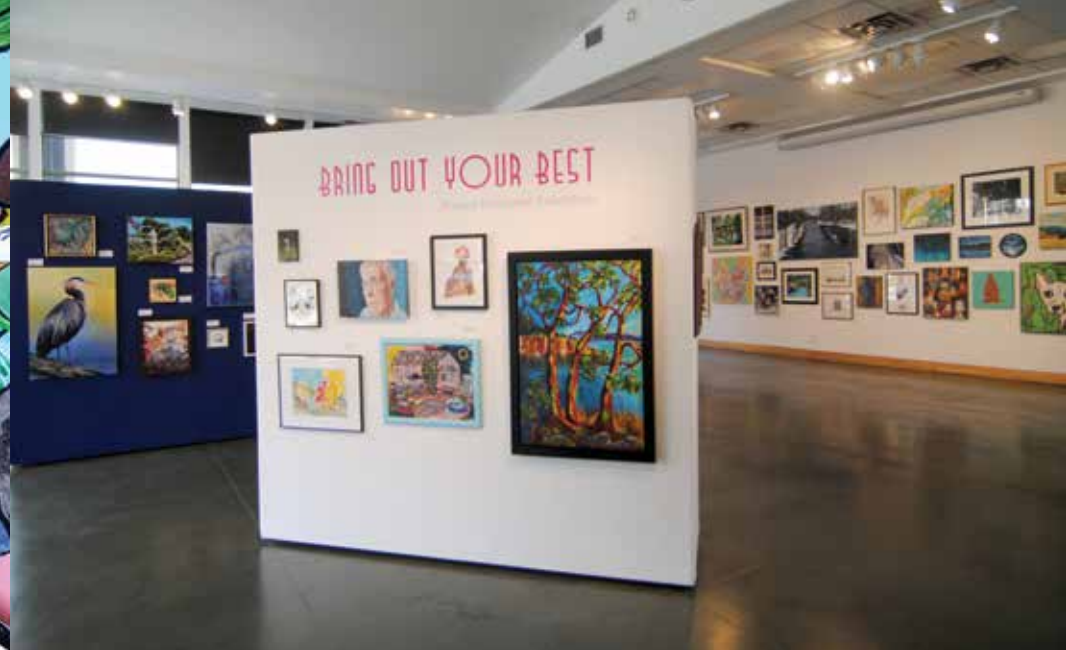
Installation photo of Bring Out Your Best , Members' Exhibition, 2018.