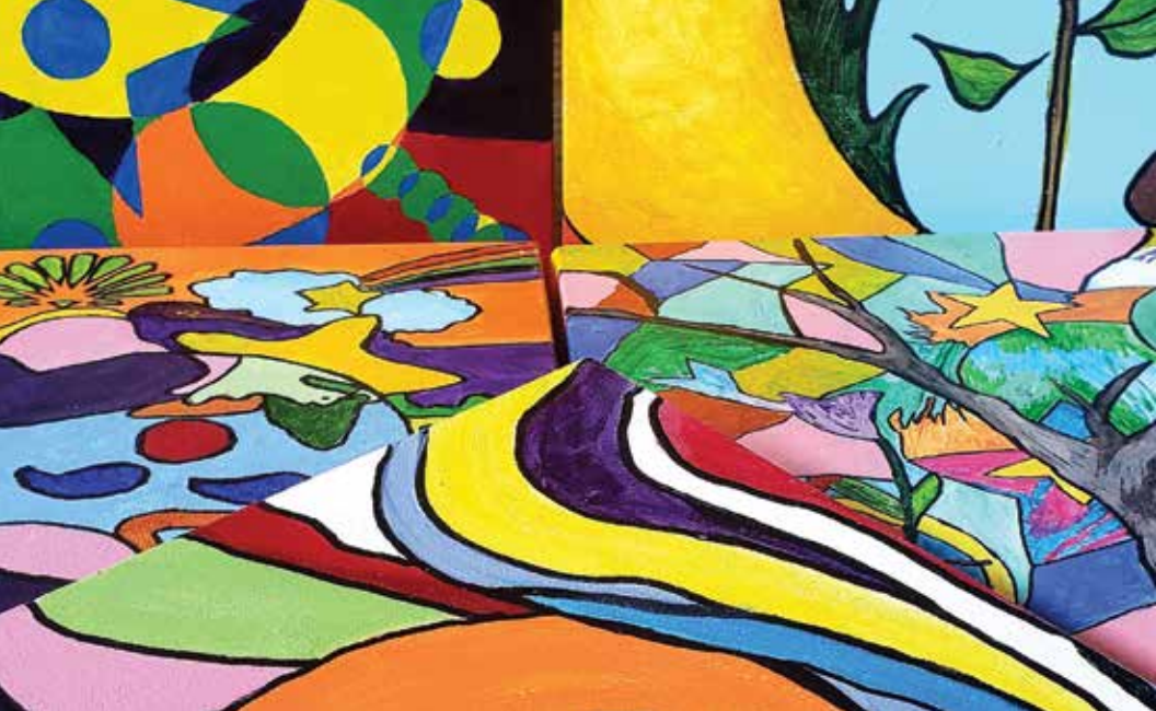
Detail shot of a few of the works that will be on view in the exhibition.