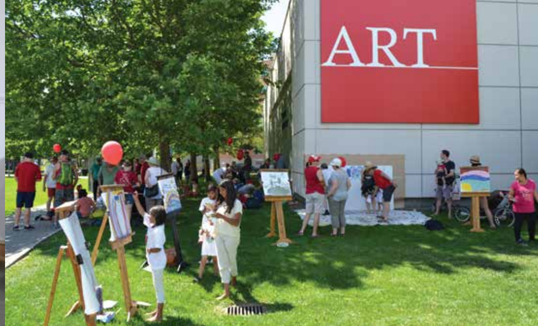
Canada Day at the Kelowna Art Gallery had a record attendance this year, with approximately 1,500 visitors and participants visiting the exhibitions and taking part in the painting activities offered.