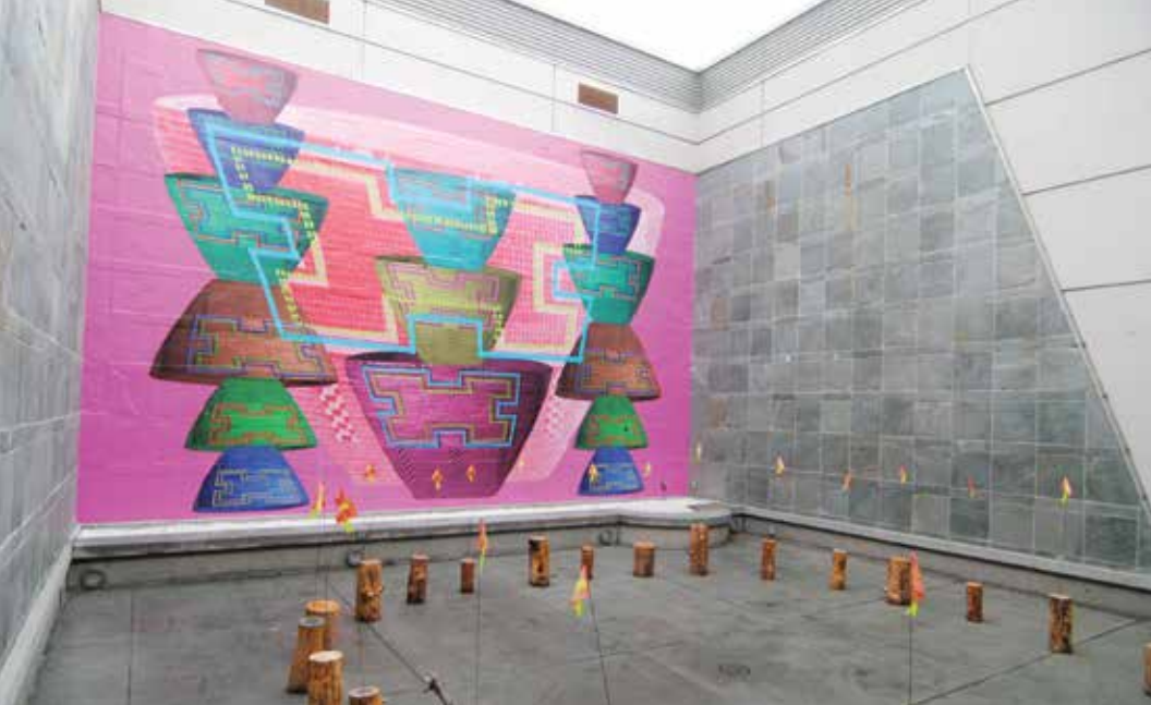
Installation of Gut Instincts in the Rotary Courtyard.