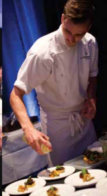
Appetite for Art Fundraiser, 2018.