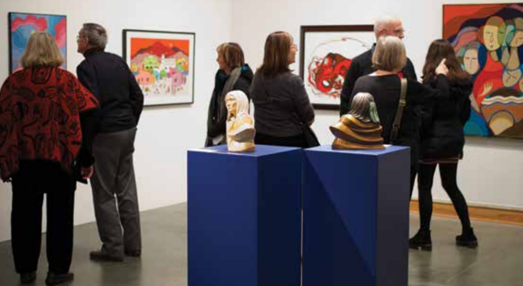
Guests at the opening reception for The Rossi Collection: A Circle of Friends , November 9, 2018.