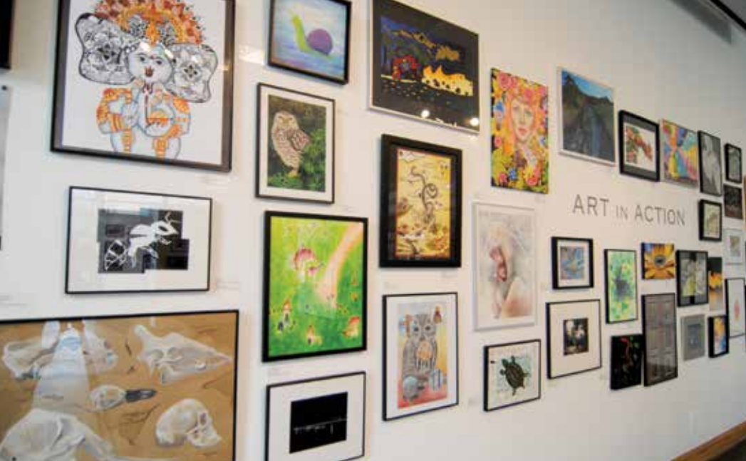
Installation of Art in Action 2018.