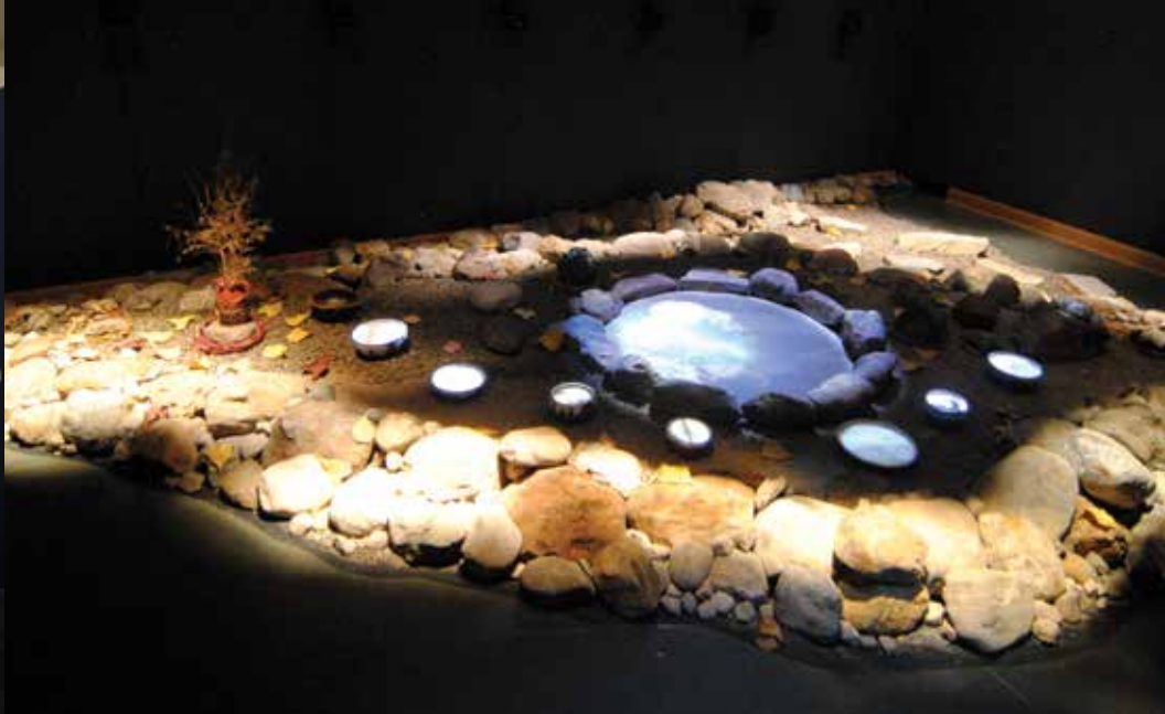
Installation view, Journey of a Pod , 2018.