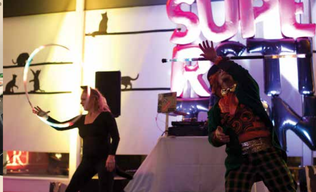
GO Party! 13: Superstition, held on Friday, November 23, 2018.