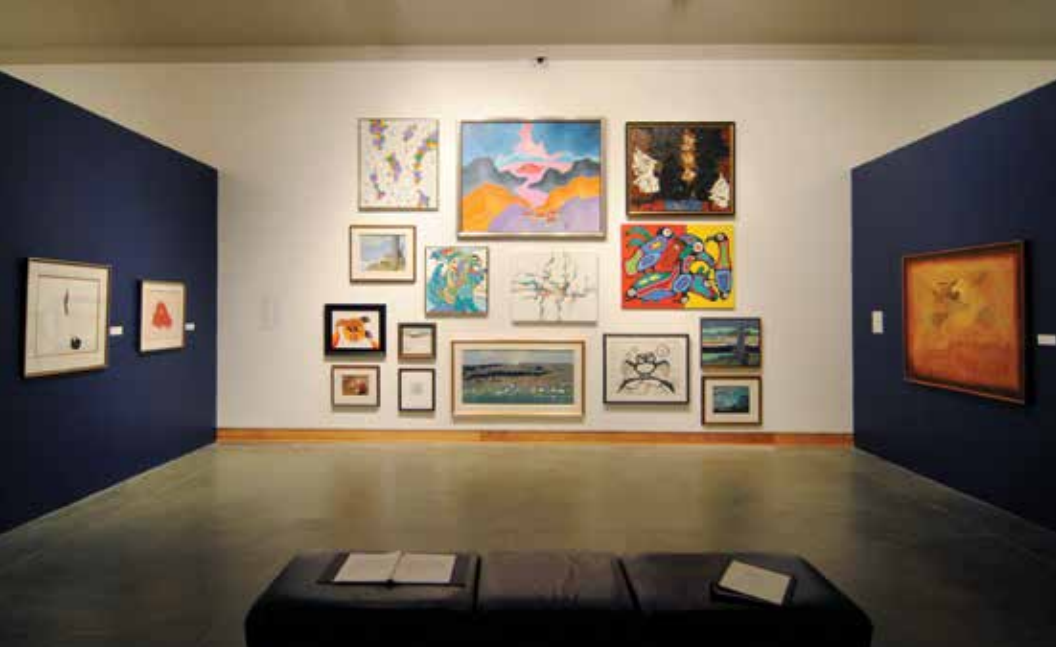
Installation view, The Rossi Collection: A Circle of Friends , 2018.