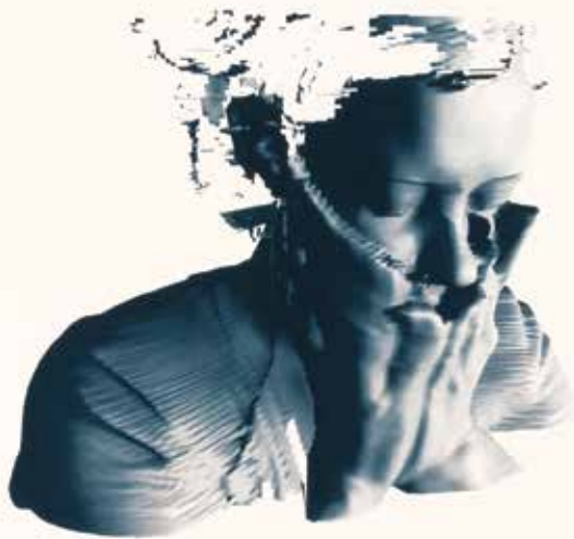
Dana Tasic, Artifact #3 (detail), 2016, screen print, 61 x 81