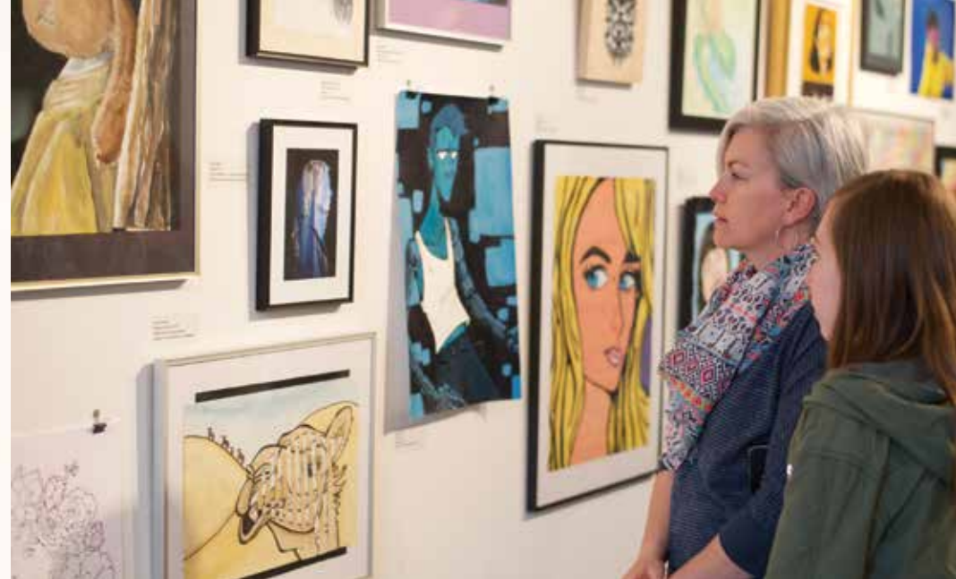
Guests viewing works by students in the Art in Action exhibition, opening reception 2017.