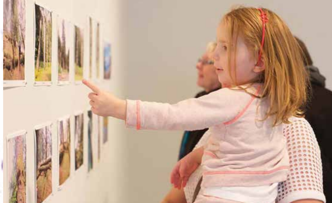
Family Day 2018 at the Kelowna Art Gallery.

They are available for purchase at the Gallery, by calling 250-762-2226, or at www.kelownaartgallery.com .