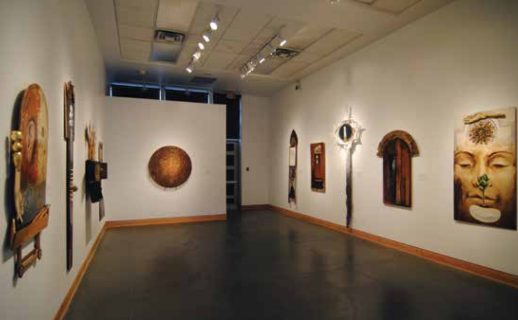
View of Immaculate Deception .